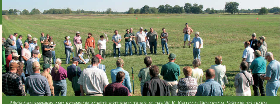
MICHIGAN FARMERS AND EXTENSION AGENTS VISIT FIELD TRIALS AT THE W. K. KELLOGG BIOLOGICAL STATION TO LEARN ABOUT DIVERSIFIED COVER CROP MIXTURES.

The USDA-funded Sustainable Agriculture Research and Education program was authorized by the 1985 Farm Bill and was first funded in 1988. SARE operates through four regional offices as well as a national office. The North Central Region serves Illinois, Indiana, Iowa, Kansas, Michigan, Minnesota, Missouri, Nebraska, North Dakota, Ohio, South Dakota, and Wisconsin.